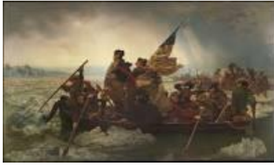
"Washington Crossing the Delaware" - By Emanuel Leutze

On the Delaware's icy waters, Boats start to teeter and tauter, Washington is out to kill Hessians, He makes a leading presence, He will lead his people to freedom, And he knows that with confidence.