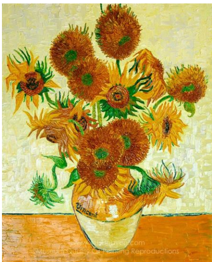
Van Gogh-Oil painting

Vase with Fifteen Sunflowers, August 1888